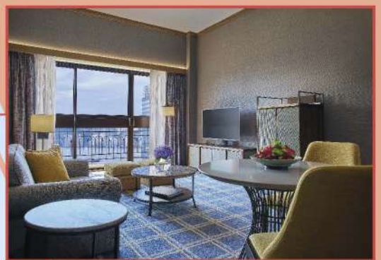
Two Bedroom Suite 雙臥室豪華套房

T +853 8793 3886 E salesenquiry.glm@artyzenhotels.com